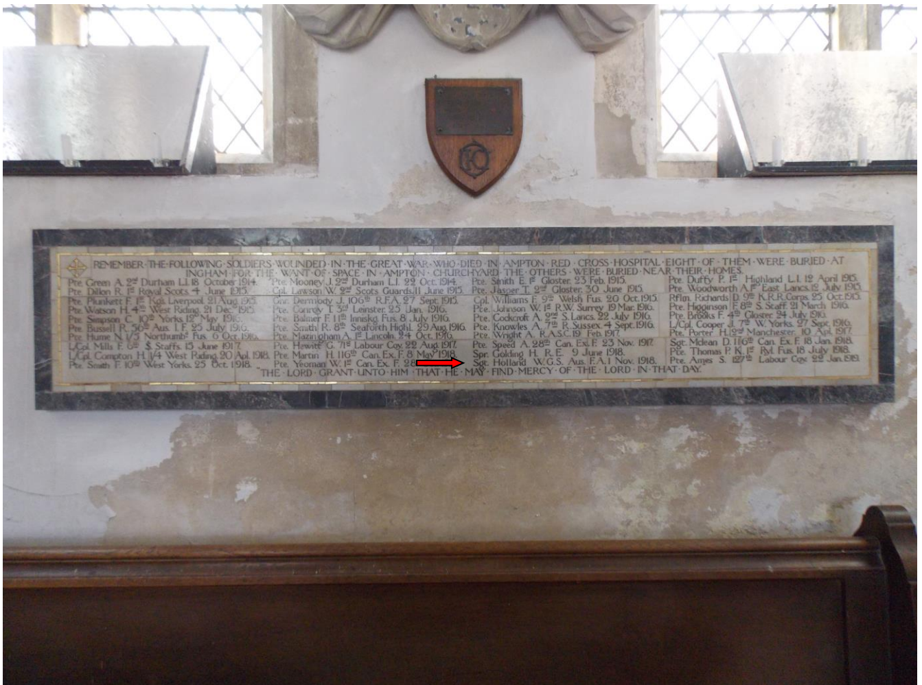
Ampton Hospital Memorial