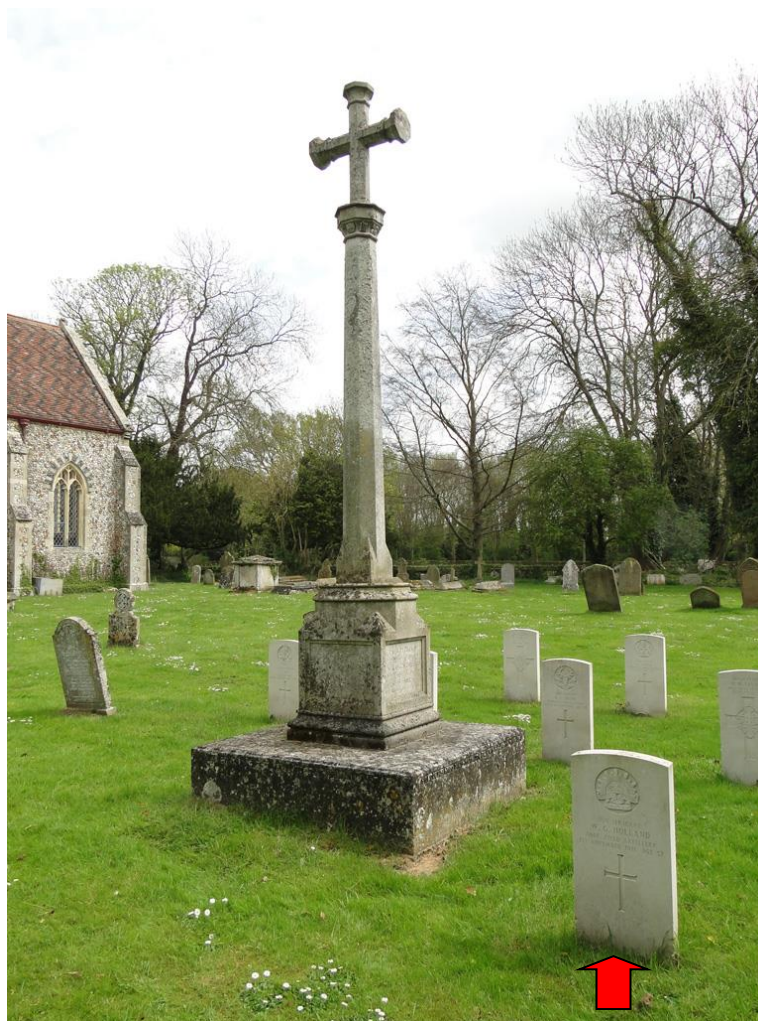
St. Bartholomew's Church, Ingham War Memorial for Ampton Hall Red Cross Hospital.