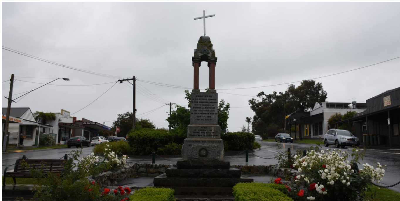
Bunyip War Memorial