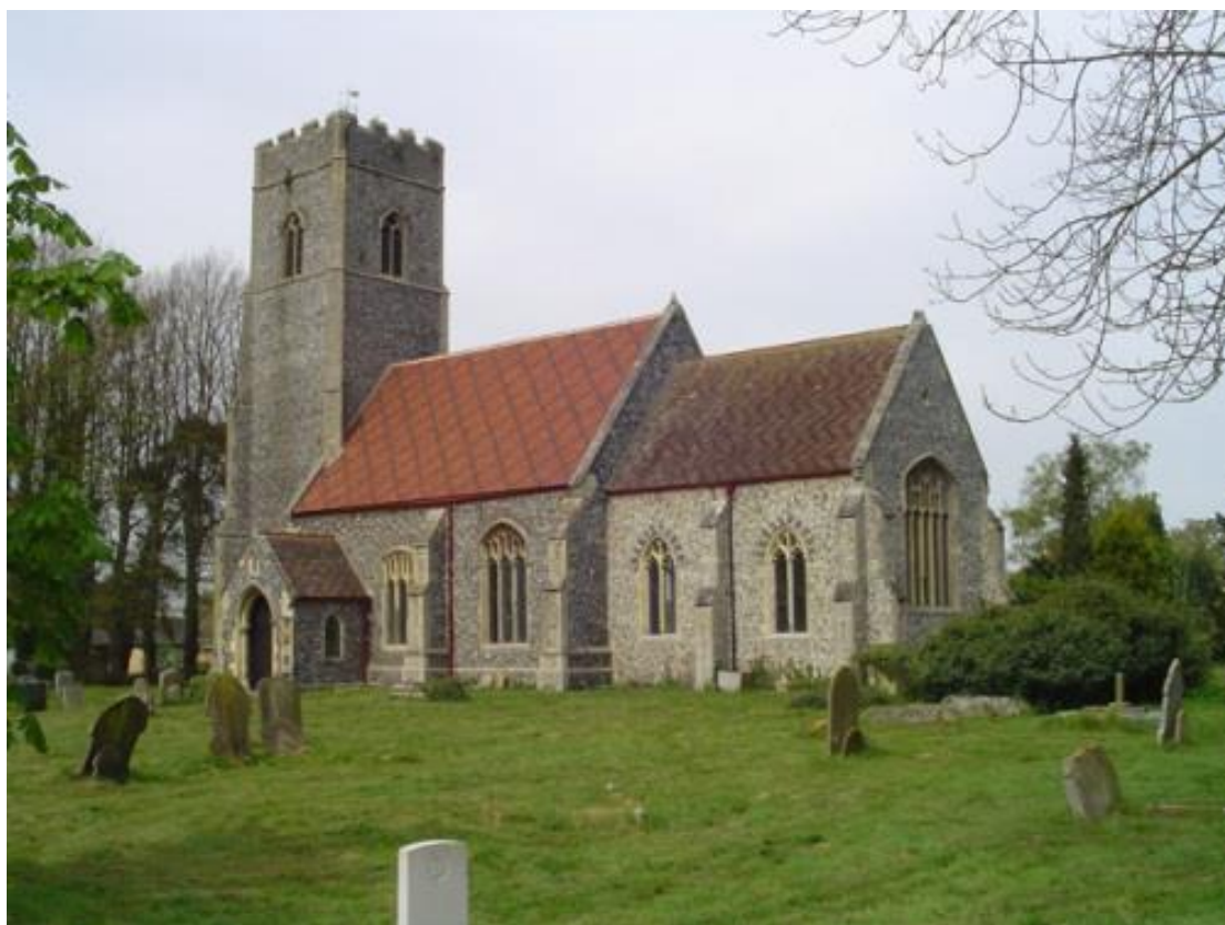
St. Bartholomew Churchyard, Ingham, Surrey

St. Bartholomew Churchyard, Ingham contains 10 War Graves, all but one being World War 1 graves. There are 2 Australian Soldiers buried in this Churchyard.